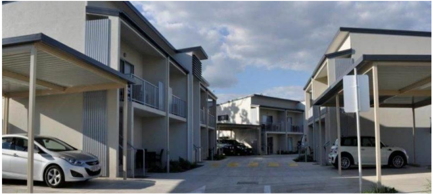
Unit 10, 10 Prince Pl, Middlemount