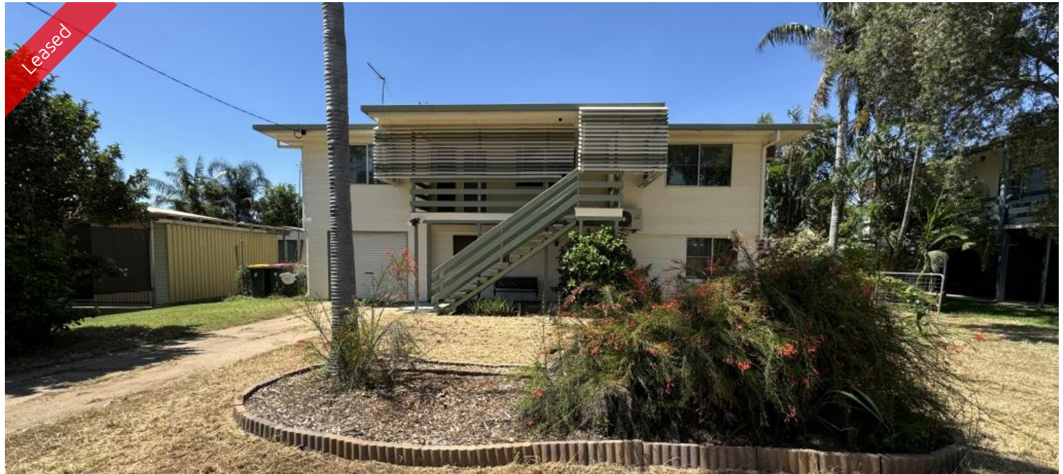
14 Rosewall St, Moranbah