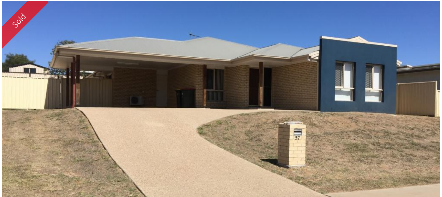
57 Hannay St, Moranbah