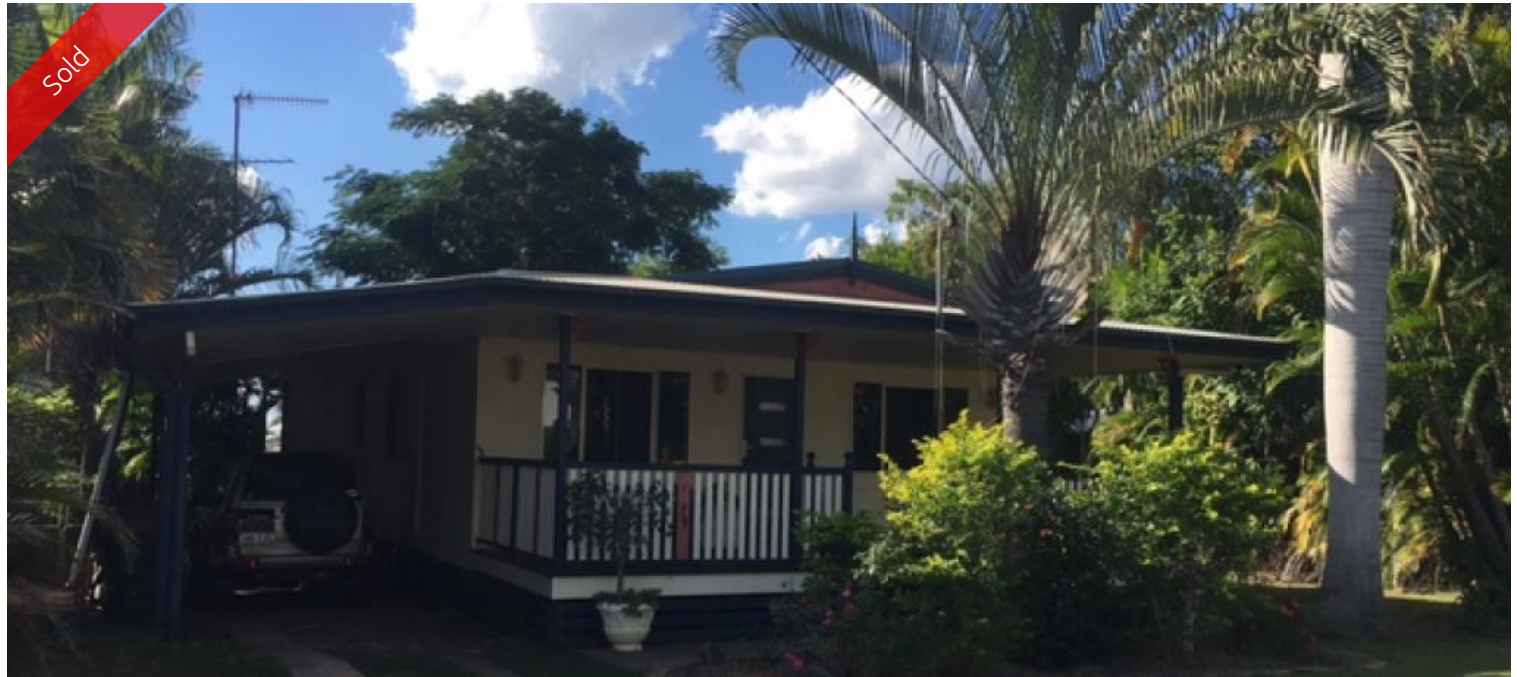
11 Casey Court, Moranbah