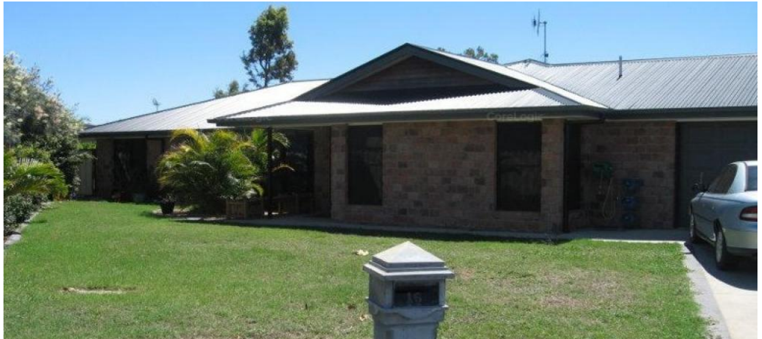
16 Turvey Ct, Moranbah