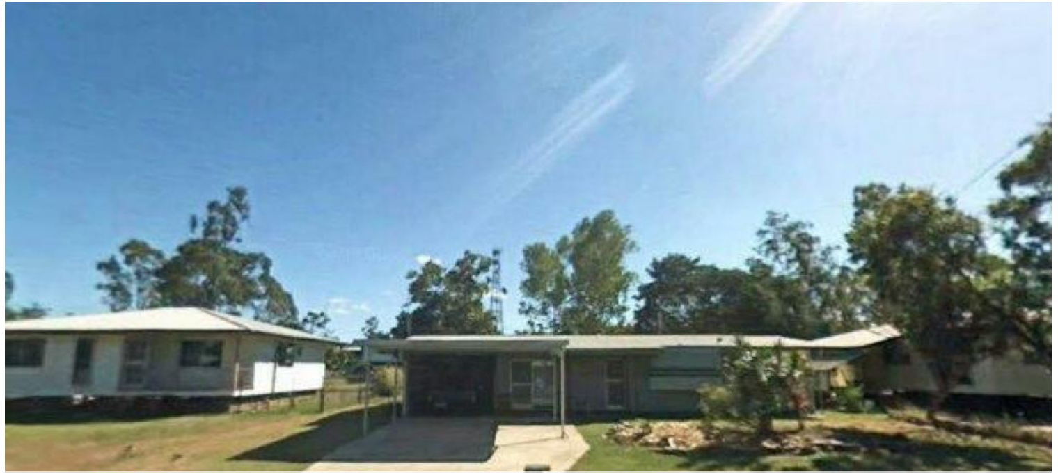
4 Menzies St, Dysart