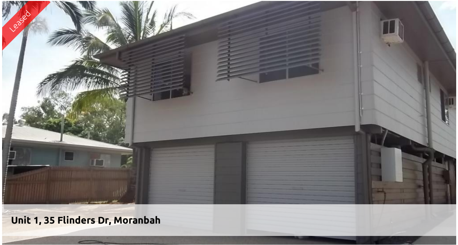
Unit 1, 35 Flinders Dr, Moranbah